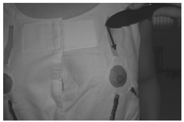
Figure 2. The direction of Gua-Sha therapy.

From the literature, we reviewed possible influences on the excretion of breast milk (Cregan et al., 2002; Lawrence & Lawrence, 2005; Riordan, 2005), including patient and