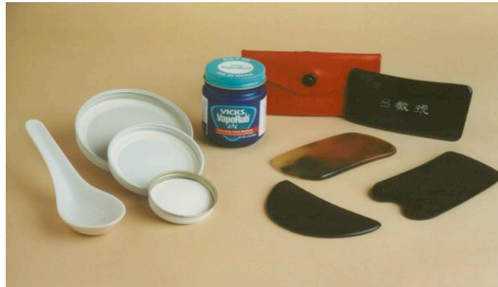
Figure 1. Gua sha tools shown: A Chinese soup spoon, round smooth-edged caps, and slices of water buffalo horn. Coins, honed jade and stone instruments are also used as well as a stiff slice of ginger (Nielsen 1995, p52).

As an essential technique of traditional East Asian medicine both in the home and in the clinical setting, tools used to apply Gua sha vary from a simple Chinese soup spoon, a smooth coin, or even a slice of ginger to instruments fashioned from cow bone, water buffalo horn, jade or stone (see figure 1). The important feature of a Gua sha tool is that the edge be smooth, not so sharp that the skin breaks but also not too blunt as to cause pain. A simple smooth-edged metal cap readily available in most homes (like that on Solgar vitamin bottle) is a perfect fit for Gua sha and recommended for use by Dr. James Tin Yau So, the well-known 'father of American acupuncture', and co-founder of the New England School of Acupuncture where Gua sha was first introduced as part of the curriculum for acupuncture study.