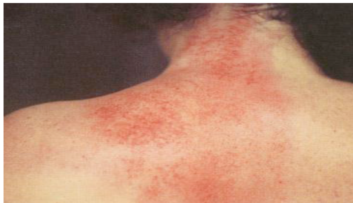
Figure 4. Sha raised on patient (Nielsen 1995, p54)