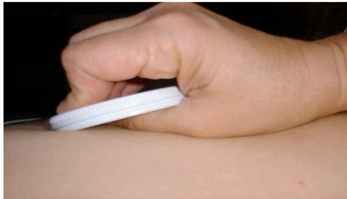
Figure 3. Gua sha tool pressing into fascial layer from left to right. Notice in both images the tool is buried in the provider's hand, that is, the touch of the provider's hand softens the sensation of the tool.