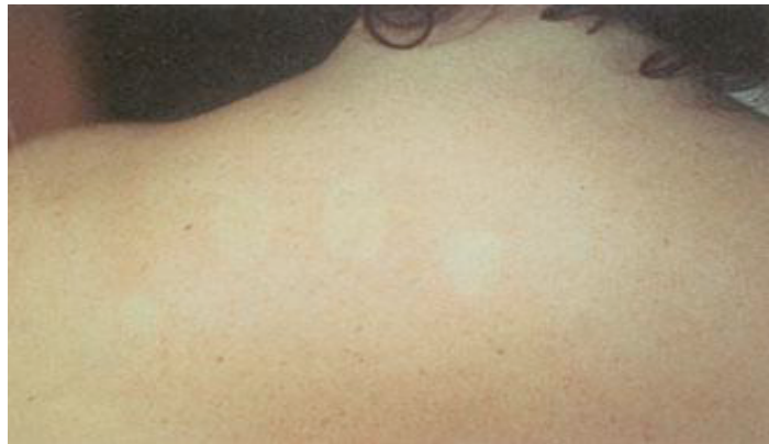
Figure 6. Blanching from pressing palpation. Blanching that is slow to fade indicates sha.

Gua sha is applied at the front and back of the body to affect the flesh, organs or function of that 'Jiao' or section of the body, according to the view of Classical acupuncture and channel trajectory in the tradition of Dr. So (1984;1987).