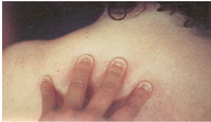
Figure 5. Pressing palpation